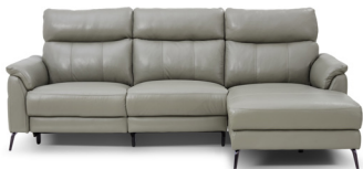
2.5ETLRPHTU+CCHR W268 x H107 x D157 cm