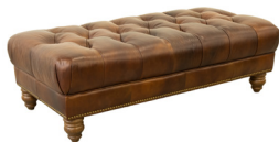
Footstool W136 x H40 x D67 cm