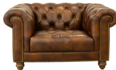
Snuggler W156 x H85 x D99 cm