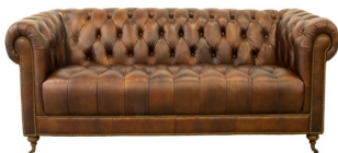
2 Seater Sofa W192 x H85 x D99 cm