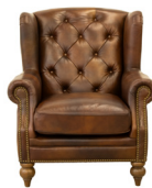
Wing Chair W85 x H106 x D97 cm