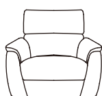
Armchair W107 x H97 x D93 cm